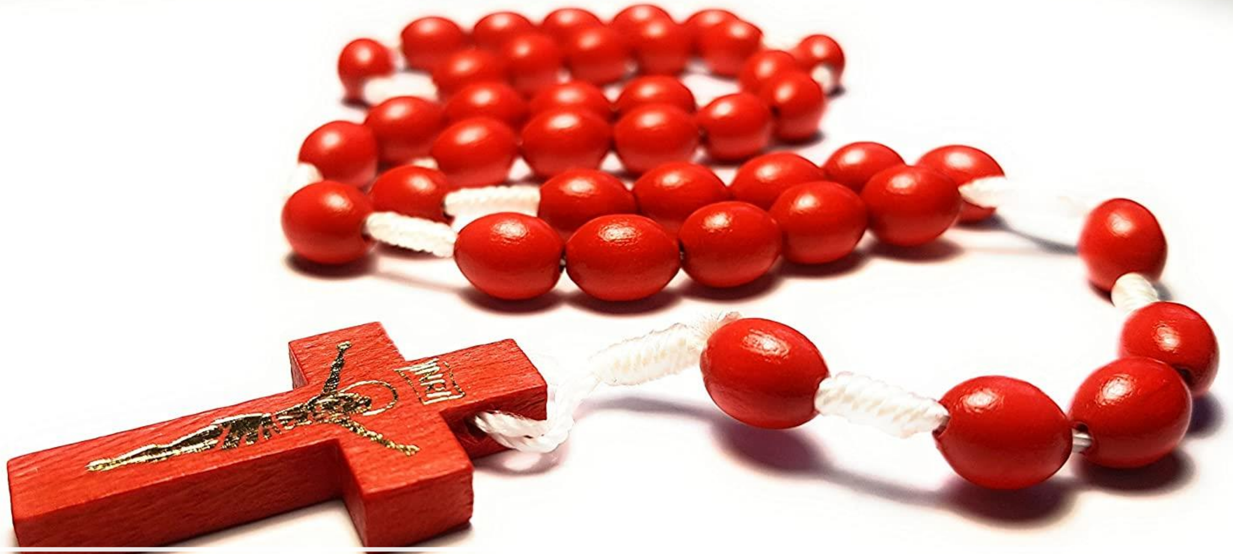
Chaplet of the Precious Blood